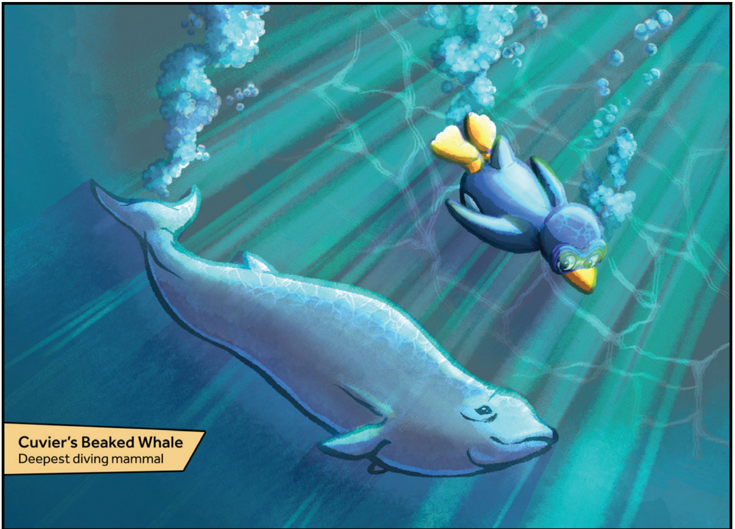
Cuvier's Beaked Whale Deepest diving mammal