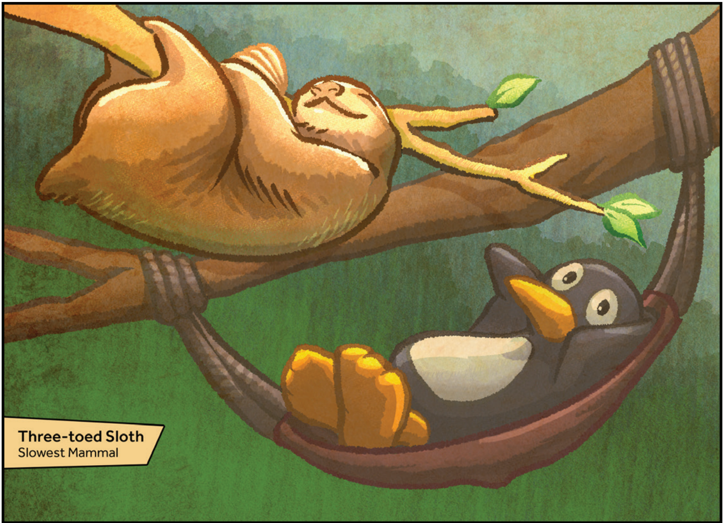
Three-toed Sloth Slowest Mammal